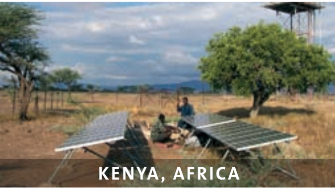
Two members of the Kaikor Water Committee examine the solar panels that supply the power to the Grundfos SQFlex pump system.